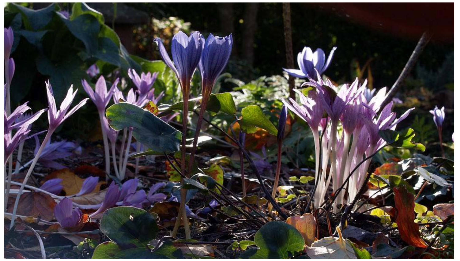
Crocus speciosus and Colchicum agrippinum

This is a typical Autumnal scene in the garden with the low sun providing back light through the flowers of Crocus speciosus and Colchicum agrippinum. When photographing into the light like this it is difficult to avoid flaring on the camera lens and you can just make out some flaring at the bottom left of the picture. I managed to avoid flaring