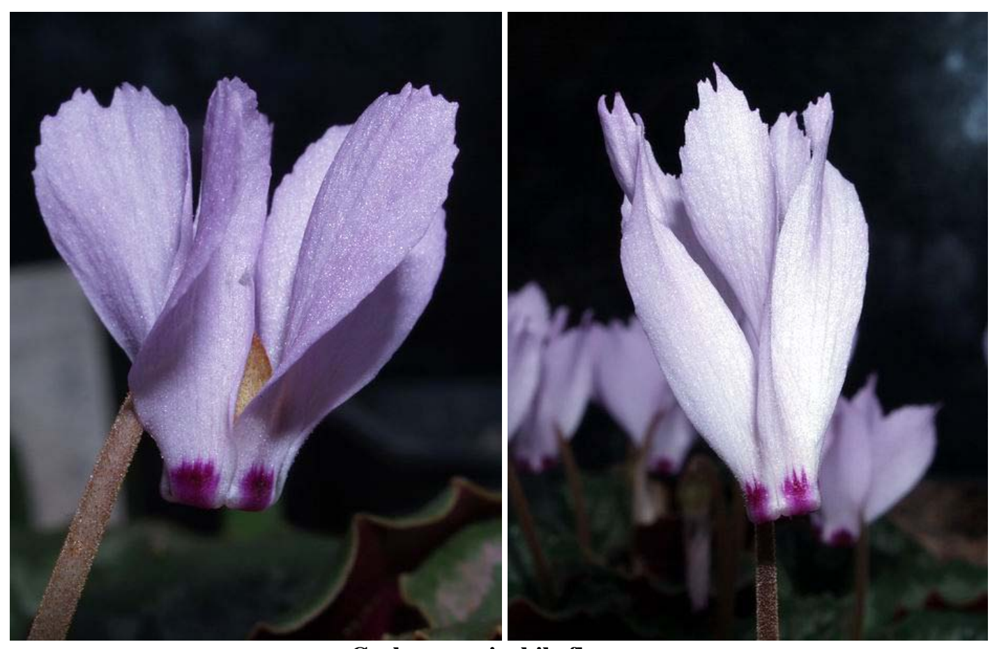
Cyclamen mirabile flowers

This Cyclamen is my favourite of this wonderful genus and as well as wonderful variation in patterns provided by the leaves the flowers offer different shapes. Some short and wide others long and narrow all with the lovely toothing along the edge.