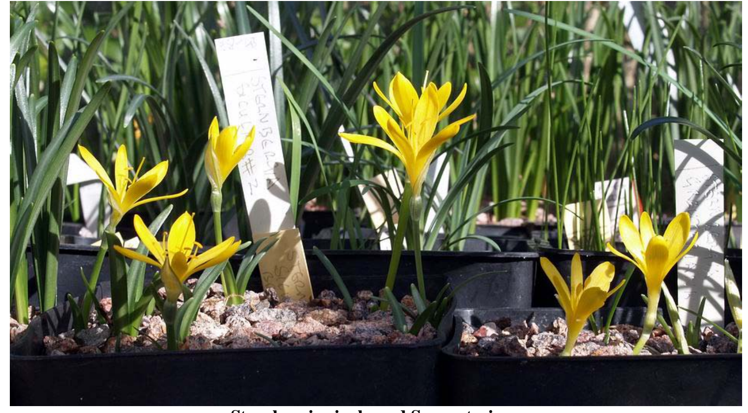
Sternbergia sicula and S. greuteriana

Now I don't want you to be laughing but this is the first flower I have managed to get on a Cyclamen graecum for a very long time. I have given all my C. graecum away to homes in the warmer south in the past but I can never resist the temptation to try once more to see if this time I can raise a form whose flower buds will ripen in our cool summers. Compared to the magnificient plants covered in flowers I see on the Forum it is pathetic but it is a step in the right direction.