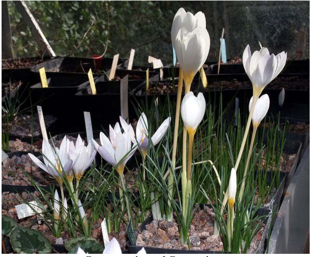
Crocus caspius and Crocus niveus

It is another Crocus with extra floral segments and anthers. I called this a mutation previously but a learned friend has pointed out that this phenomenon should be called a modification because it is temporary effect- a mutation would be genetic and recur each year.