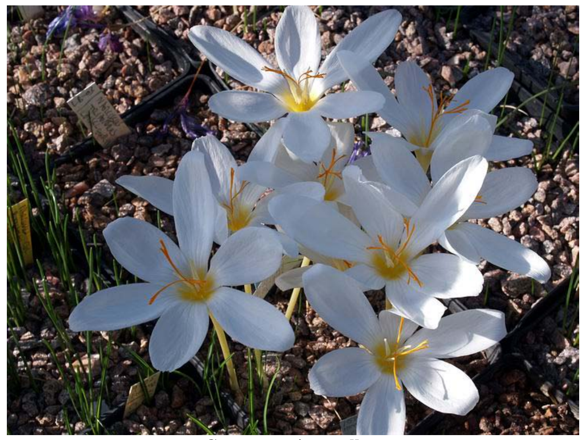
Crocus speciosus albus

This is the open flower of the Crocus speciosus above showing its wonderful rich markings and its deep orange multi-divided and branched style.